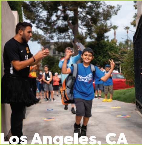
Los Angeles, CA