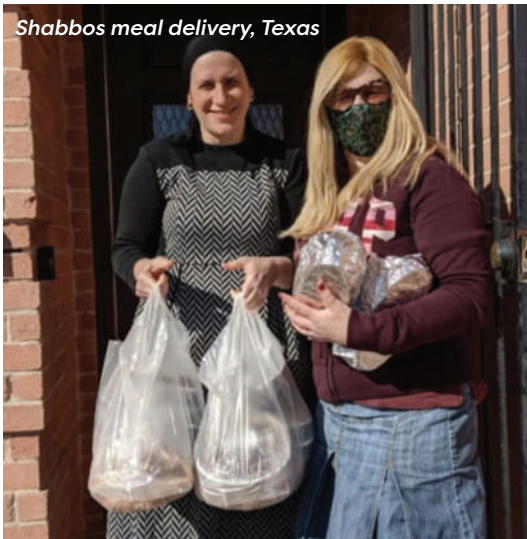
Shabbos meal delivery, Texas

After a blizzard devastated Texas in February, Chai Lifeline Southeast mobilized its volunteers to deliver Shabbos meals and care packages to families in the area.