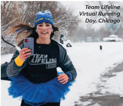
Team Lifeline Virtual Running Day, Chicago