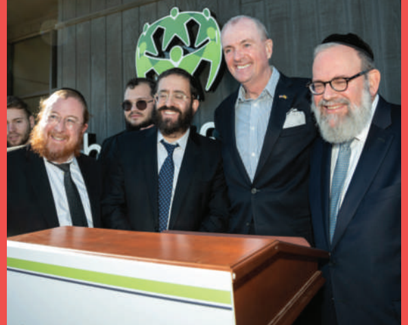
Gov. Murphy visits Chai Lifeline NJ/PA offices

Chai Lifeline ended the year with a series of weekend retreats at Camp Simcha for families and volunteers, helping them reconnect and recharge for the year ahead.