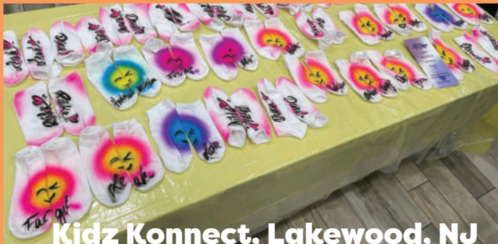
Kidz Konnect, Lakewood, NJ