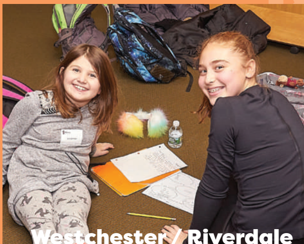
Westchester / Riverdale