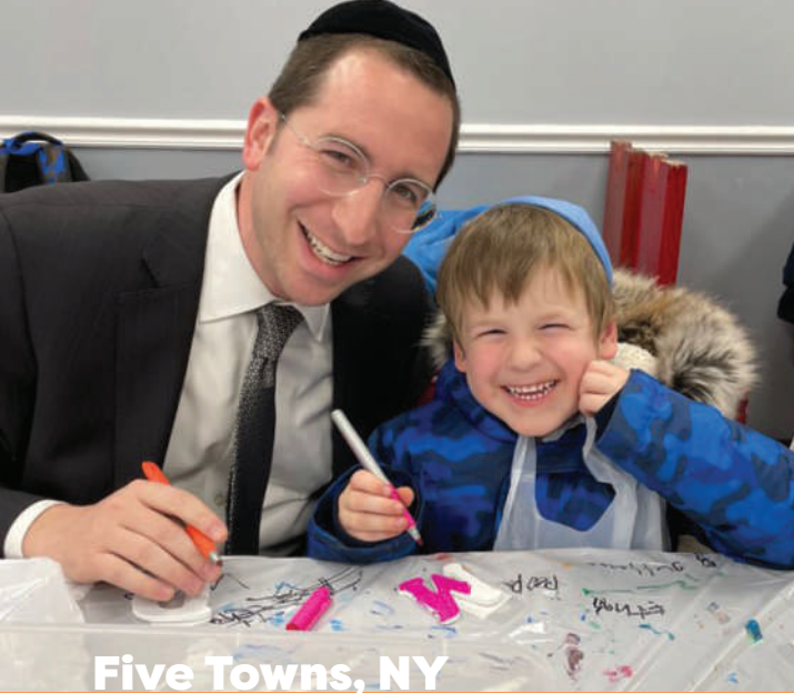
Five Towns, NY